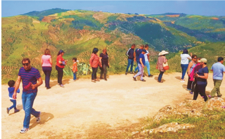
Birth of an eco-tourism circuit in Thibar. TALAE creates hiking trails of discovery and exploration. Here Jebel Thibar and Jebel Sayar.

TALAE's mission is to gather, represent and support its members on the one hand, and to promote the profession in the protection, enhancement, management and creation of landscapes on the other hand. It aims to contribute to a sustainable, functional environment, attractive and healthy for the population.