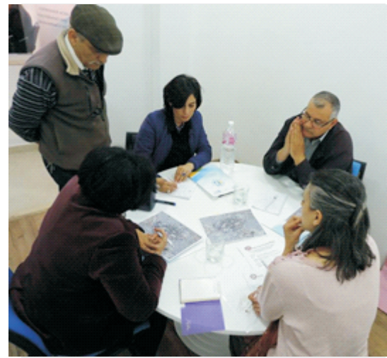
TALAE and local civil society: reflection workshop

The project requires the sacrifice of 30 ha of Rades forest, one of the few green spaces in the southern suburbs of Tunis, and the uprooting of more than 15,000 trees. This has aroused the anger of residents of the region and associations including TALAE who organized several protests to stop the project. The outline of the new road is drawn in yellow in the diagram below.