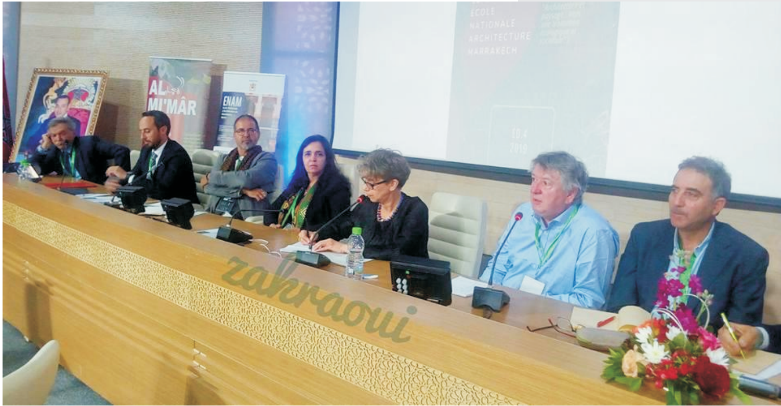
The National School of Architecture in Marrakech (Ecole Nationale d'Architecture Marrakech -ENAM) symposium