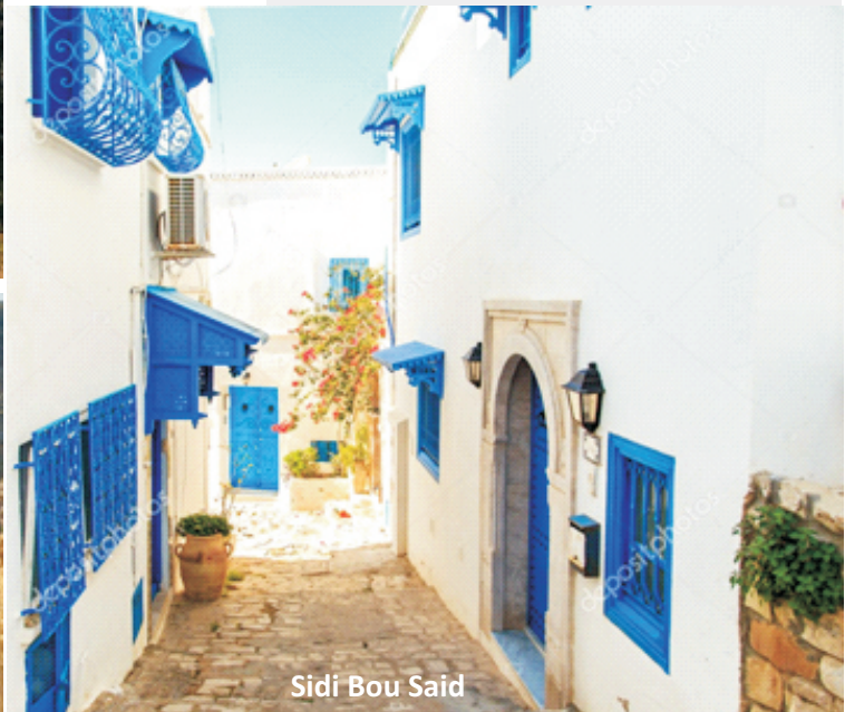
Sidi Bou Said