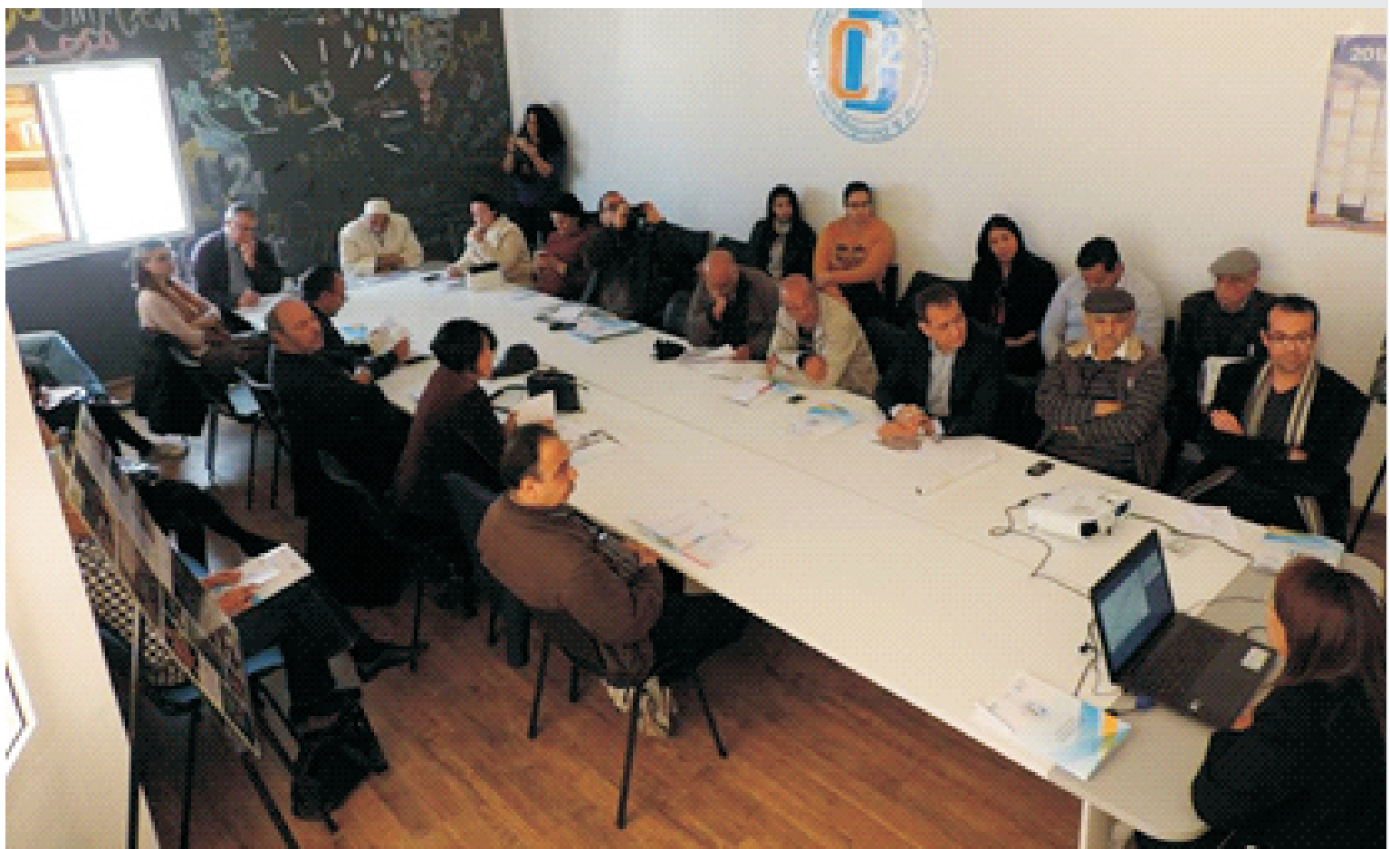
Day of consultation with TALAE members and the civil society at AMIS headquarters, 2018