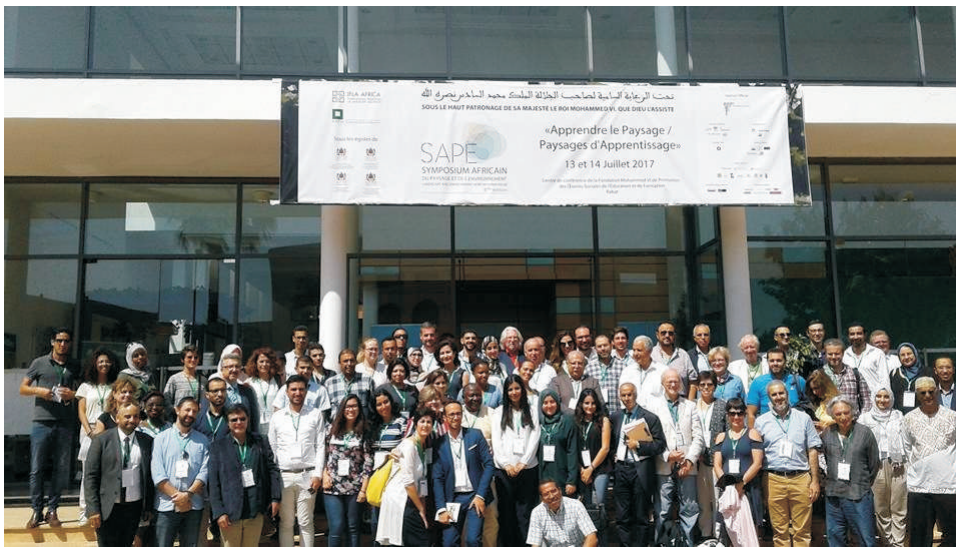
Symposium Africain du Paysage et de l'environnement held last July 2017 at La Fondation Mohamed VI

Created in 2010, the Association of Landscape Architects of Morocco (AAPM) is among the youngest associations in Africa.