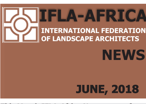
This Month IFLA-Africa News comes from

Instead of differentiating its role, the profession must now promote to its peers in the built environment and green industry how it forms an essential part of an integrated design approach . One of working of with other professionals and allied landscape practitioners; from contracting, maintenance, irrigation, plant cultivation, ecological sciences and land rehabilitation disciplines. Opportunities are starting to emerge where the landscape architect is the project leader of these integrated design teams. As an example, with the growing understanding among government departments of the benefits of green infrastructure, a window of opportunity is opening for landscape architects to lead these projects. To capitalise on this opportunity landscape architects need to acquire new skills and form new partnerships with allied built environment and green industry professionals.