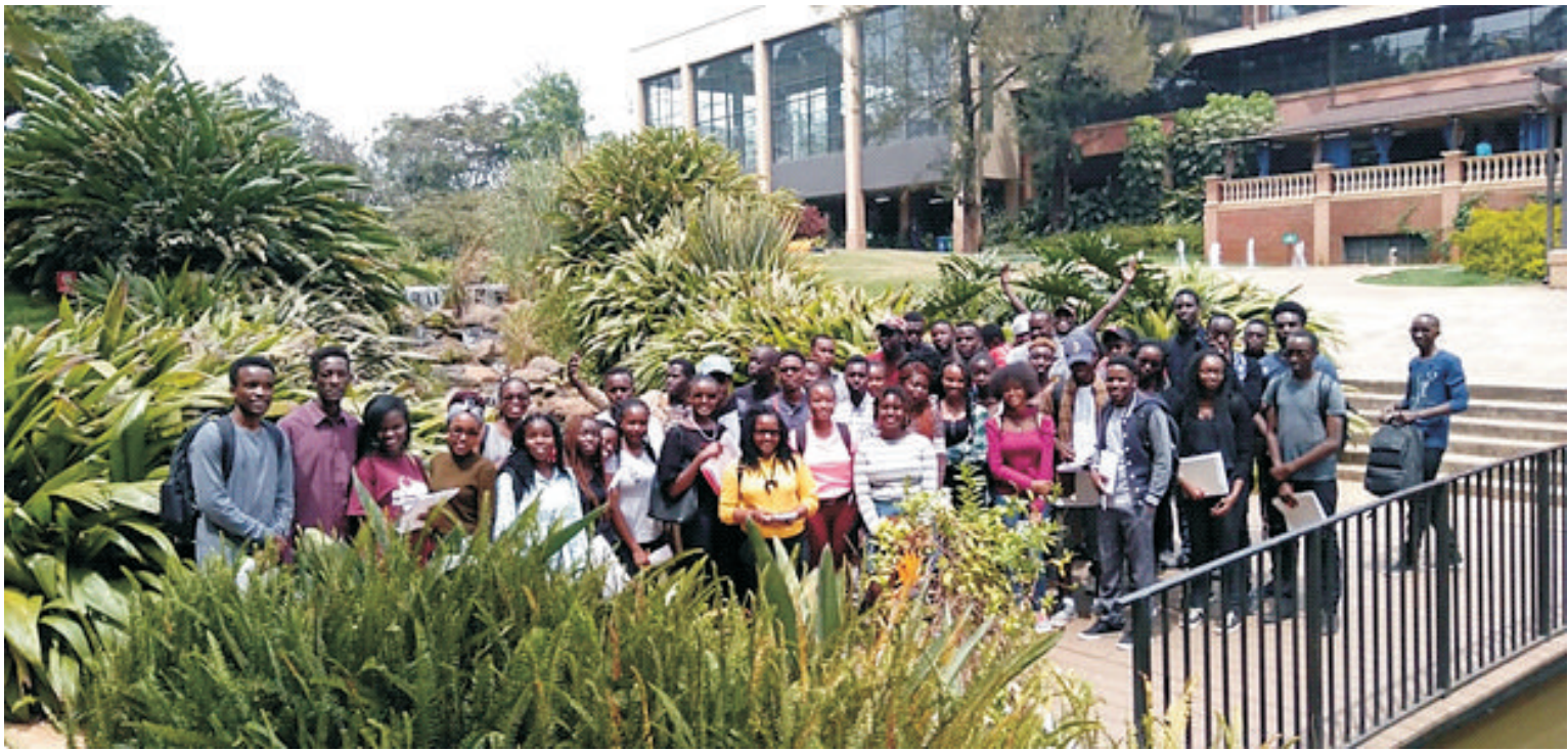
Department of Landscape Architecture, JKUAT: Faculty Students during a site excursion.