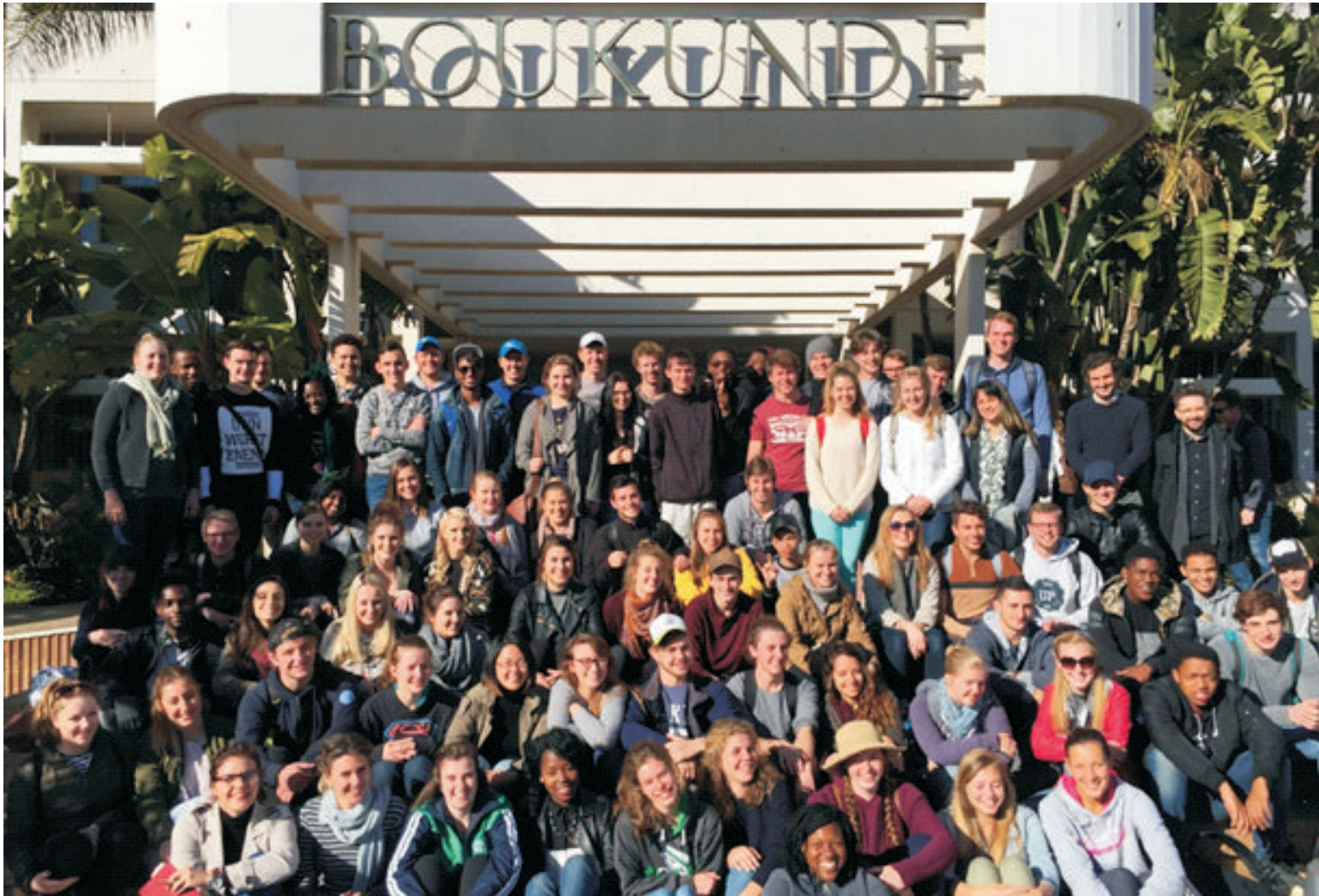
Department of Architecture, University of Pretoria: Faculty Students during a faculty seminar.