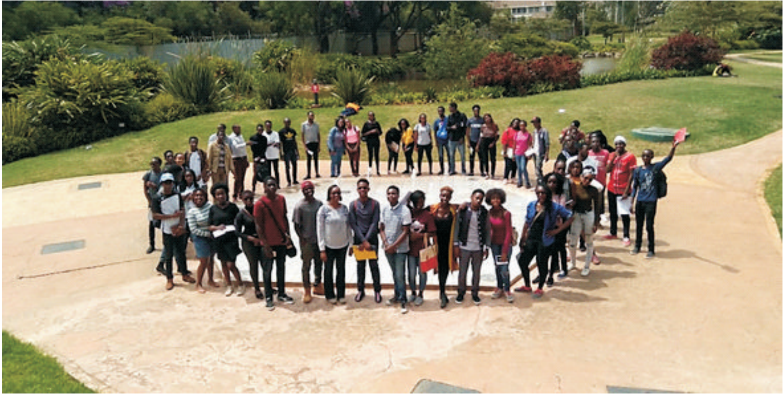
Department of Landscape Architecture, JKUAT: Faculty Students during a site excursion.