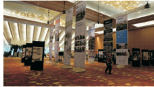
Poster exhibition at the conference