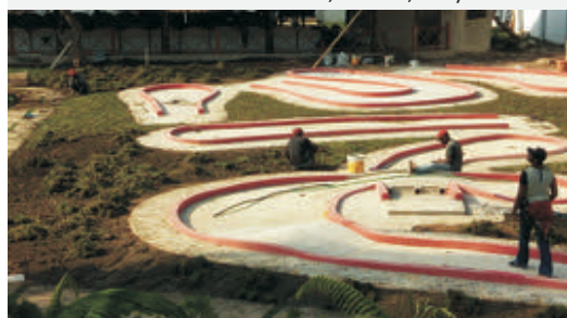
Msasani Sports Facility Mini Golf Construction underway. By Landscape Architect Carolyn Wanza of Ecoarch Solutions Ltd. (Nairobi)