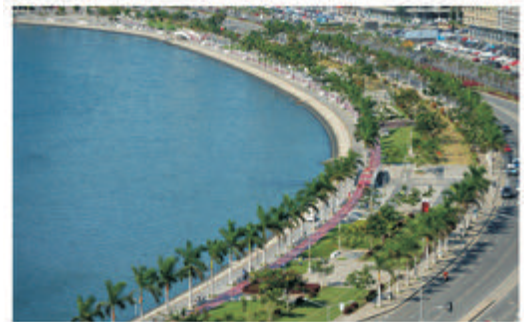
AWARD OF EXCELLENCE: LUANDA BAY, Water front requalification, Angola –by LandPlan