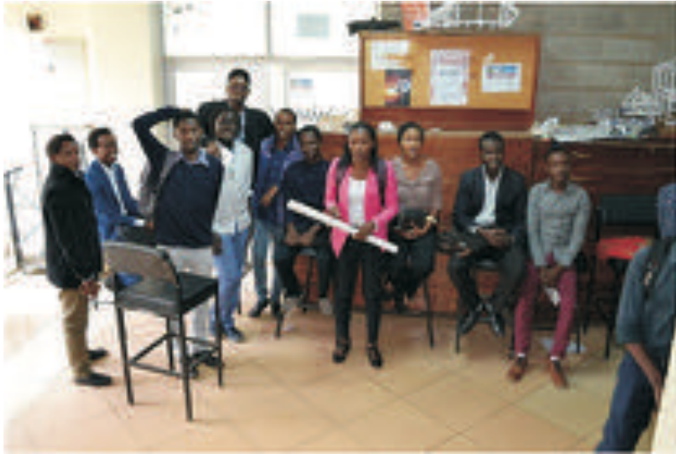
Class of 2018 Students in their working studio