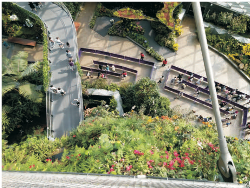
Photo from Singapore Garden Festival