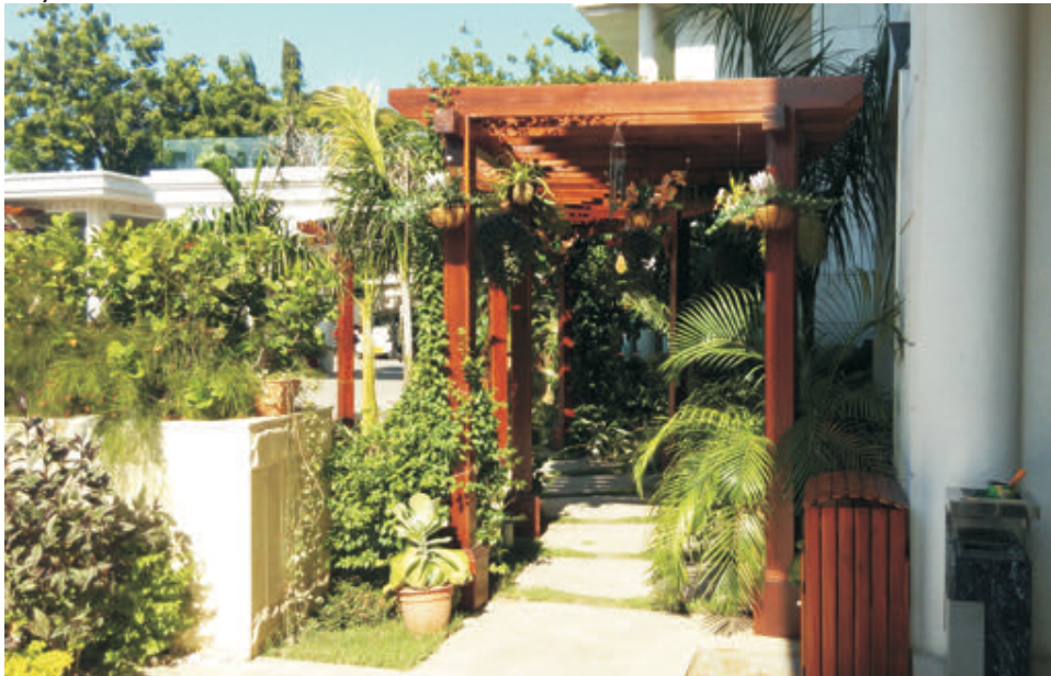
Private residence by Landscape Architect Ambrose Ofafa of Ecoarch Solutions Ltd. (Nairobi)