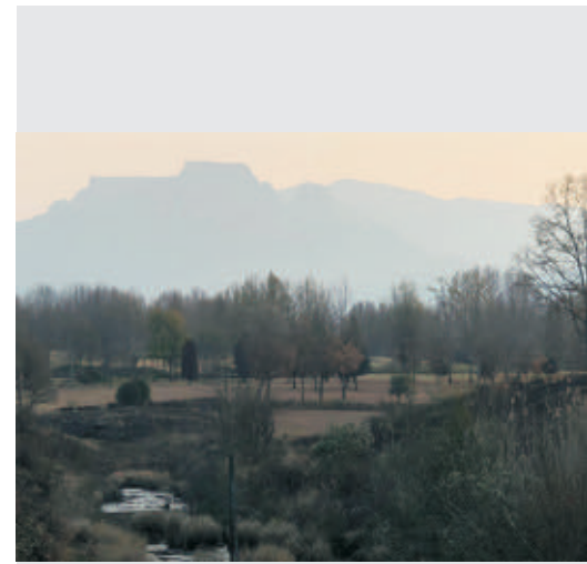
An early evening winter landscape at the conference venue- the Drakensberg mountains take on an ethereal quality.