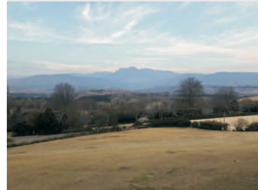
What a view to wake up to!