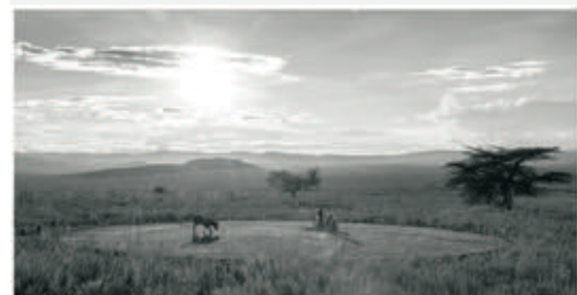
HONORABLE MENTION: SAVANNAH CIRCLE, Lewa Wildlife Coservancy, UNESCO World Heritage Site, Kenya – By The Chincol Company LTD