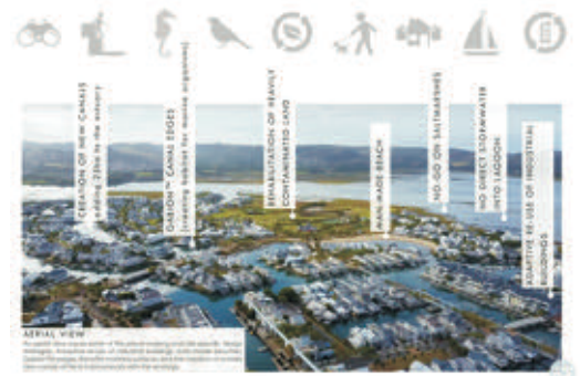
AWARD OF EXCELLENCE: THESEN ISLAND BLUE FLAG MARINA DEVELOPMENT CMAI – by CMAI South Africa