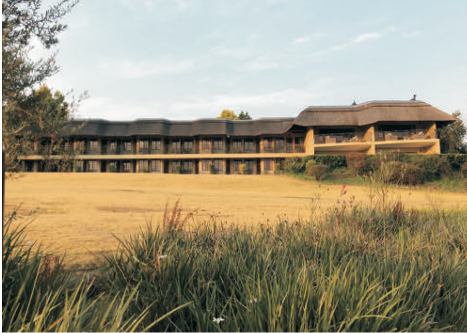
View towards the thatched hotel block across a typically yellow lawn so characteristic of a South African winter