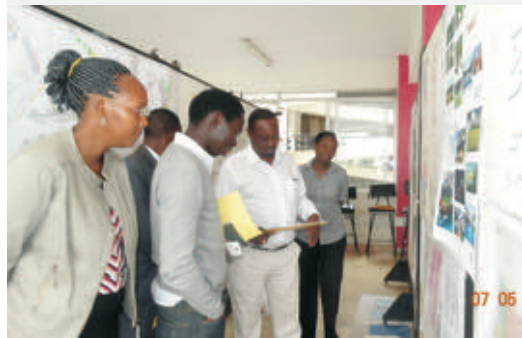
Department Staff members and student