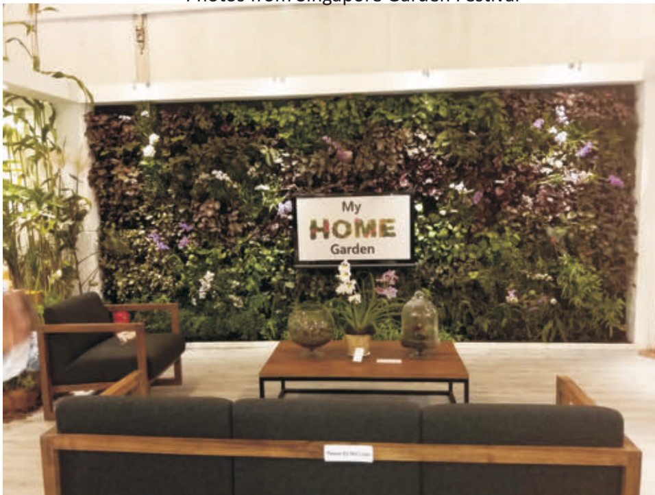
Photos from Singapore Garden Festival