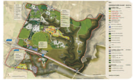
OUTSTANDING AWARD CROSSWAYS FARM VILLAGE – by CMAI South Africa