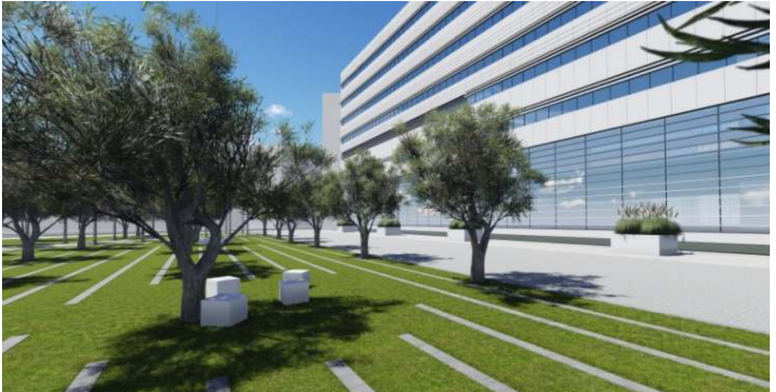
Square north urban center, design OM-landscape designer