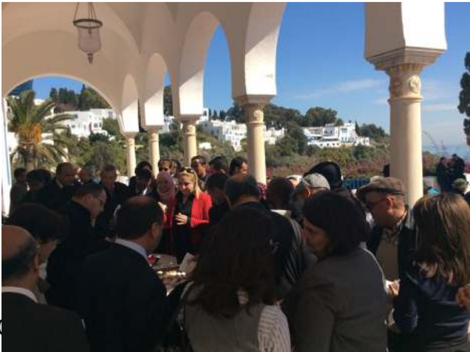
Meeting around the landscape issue in Tunisia organized by TALAE, Sidi Bou Said, March 2016