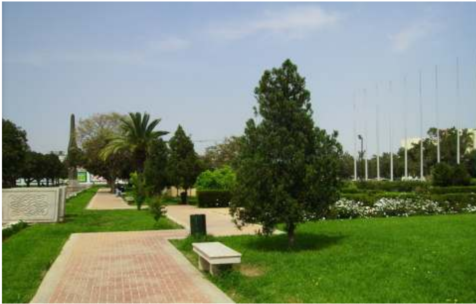
Garden of Human Rights, Tunis. Design office Cypress.