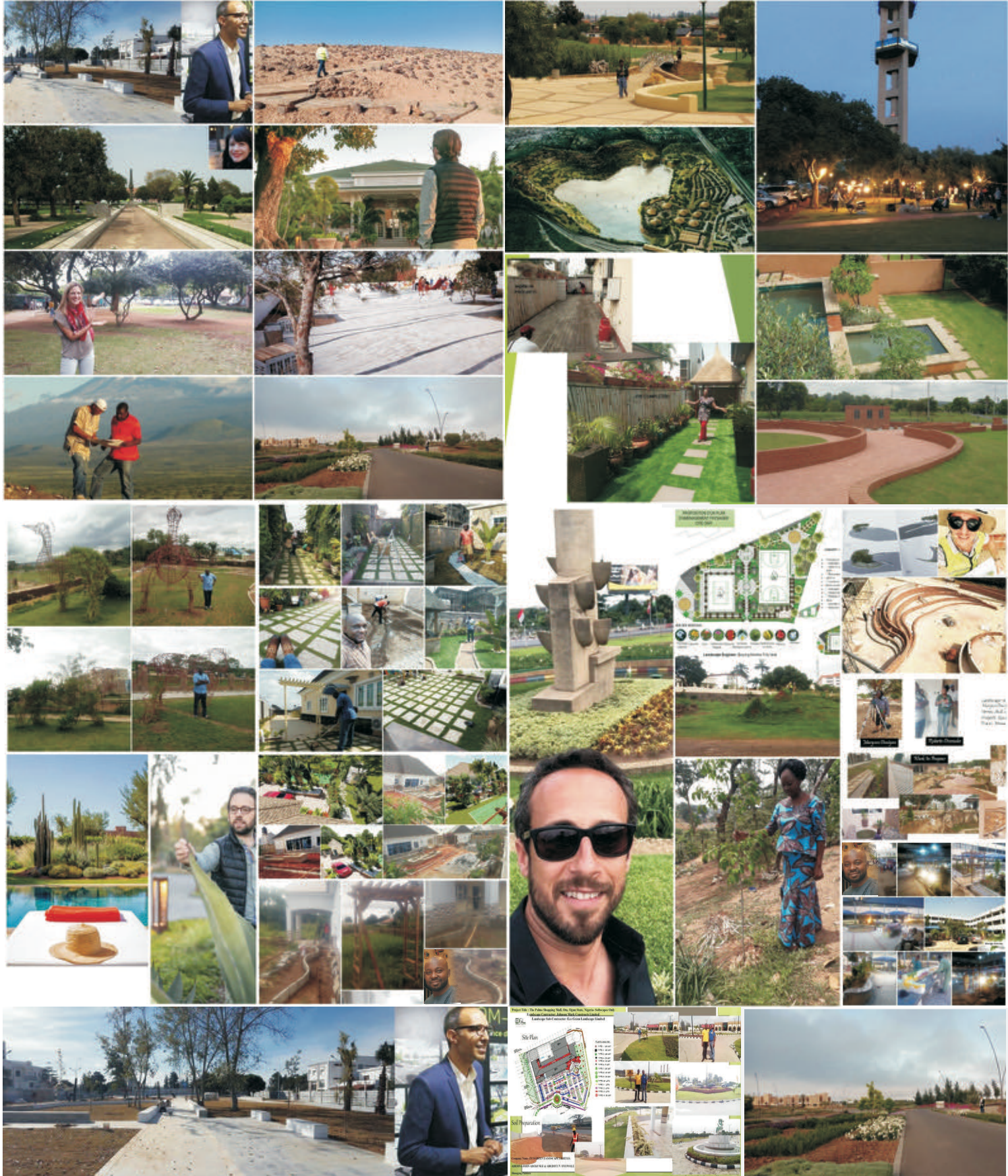
WLAM Photo Project by Carey Duncan

https://web.facebook.com/pg/IFLA.Africa/photos/?tab=album&album_id=961305280735482