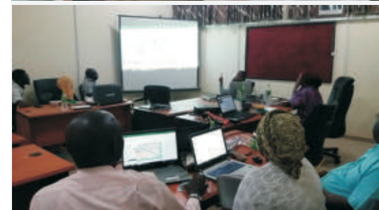
Ahmadu Bello University MLA Students and research team Collaborative sessions for the Geodesign project

The IGC has over 100 participating Universities and organisations around the world and is the biggest assembly of Geodesign focussed academic designers with the goal of sharing research and promoting the agenda of collaborative design ( www.geodesigncollab.org ). The IGC looks at the generic but critical challenges facing nations globally, and how to plan, manage and pay for infrastructure essential to addressing demographic and climate challenges.