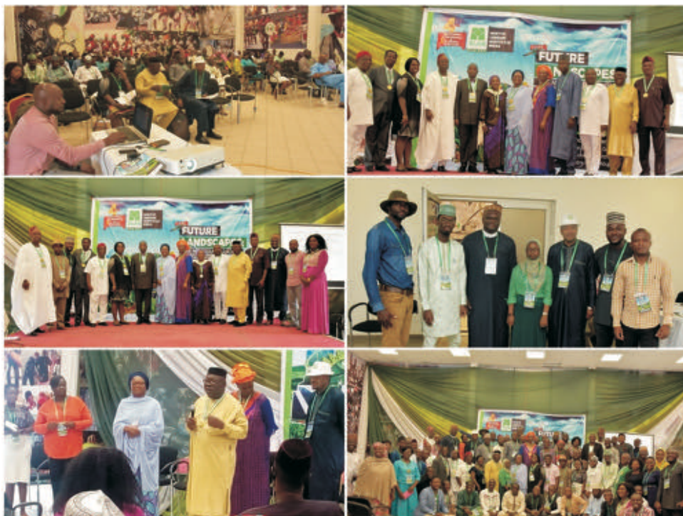
Photo Highlights of the SLAN conference

An important event at the conference was the First Fellowship Investiture of SLAN.